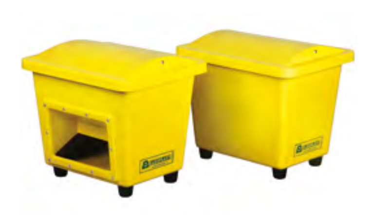
SBA 110 with/without emptying opening.

They are made of fibreglass highly resistant to mechanical, weather and chemical influences (easy graffiti removal). On customer request we laminate coloured logos, inscriptions, numbers, etc. into the surface of the grit bin. 5-year warranty period.