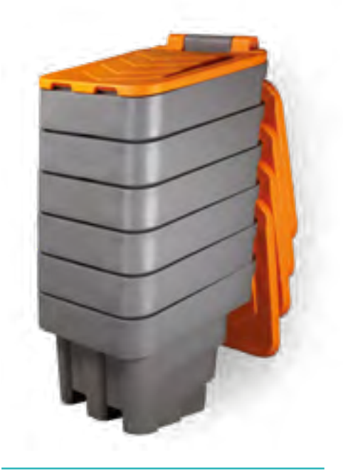
STACKED GRIT BINS